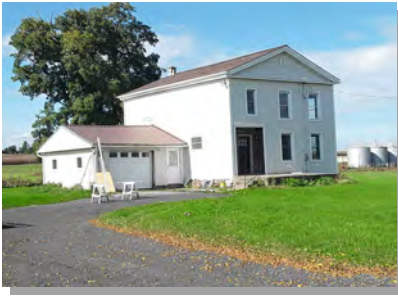
453400 16-1-45.2 1438 Gravel Rd