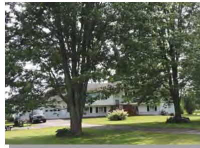
452400 15-1-41 1292 Gassner Rd