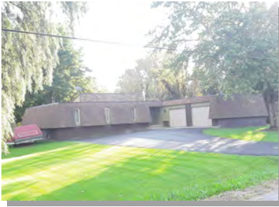
453400 12-1-14.12 2212 West Brook Rd