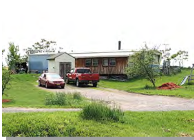
452400 11-1-15 1318 Whiskey Hill Rd