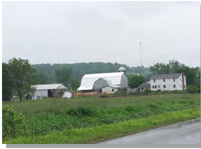
452400 02-1-07 932 Hatch Rd