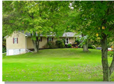
453400 15-1-16.22 2135 Worden Rd