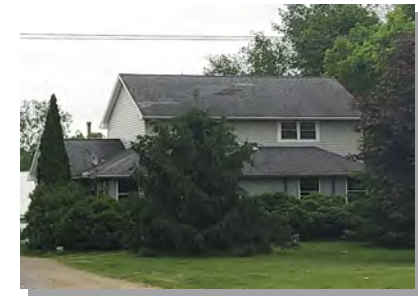
452400 08-1-18.12 1169 Ninefoot Rd