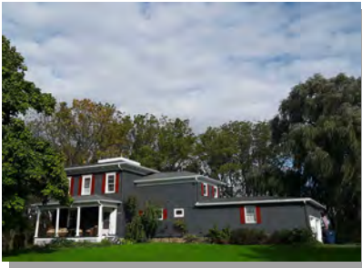
453400 16-1-02 1283 Middle Black Brk Rd