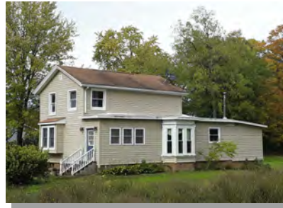
453400 06-1-12.2 695 Gravel Rd