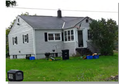
453400 15-1-18.11 1909 Worden Rd