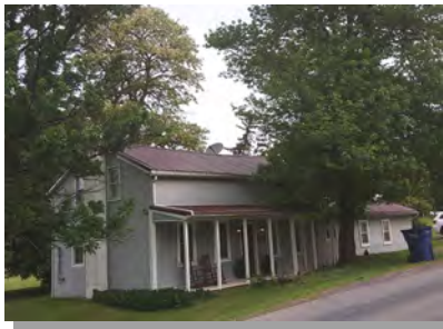
452400 07-1-13.112 348 Bostwick Rd