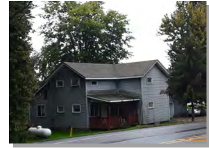
453400 15-1-04.2 1820 Route 318