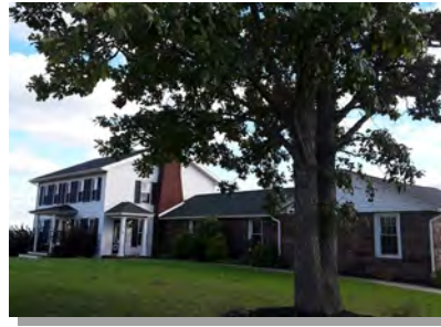
453400 03-1-09.12 3230 Route 89