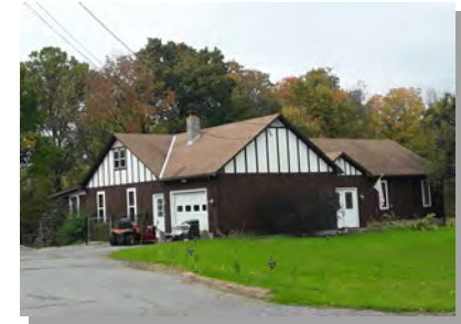
453400 10-1-22.2 802 Gravel Rd