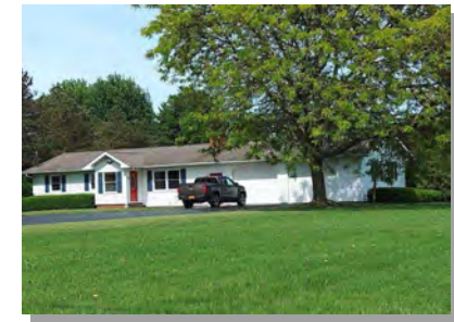
452400 15-1-44 1589 Mills Rd