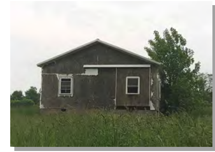
452400 06-1-13.3 651 Birdsey Rd