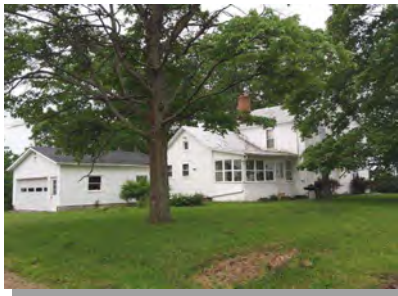
452400 14-1-20.2 1673 Ninefoot Rd